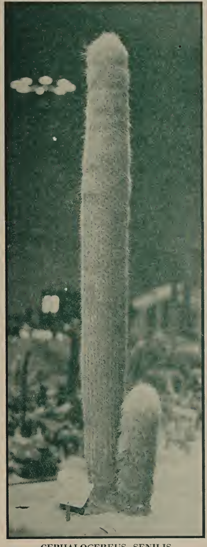
CEPHALOCEREUS SENILIS The Old Man of Mexico

The Cephalocerei are usually tall plants with long hairs or wool on them.